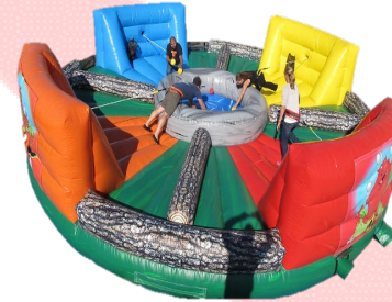
Hippo Chow Down