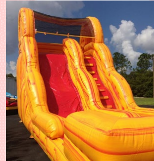
Lava Rush (30' H)